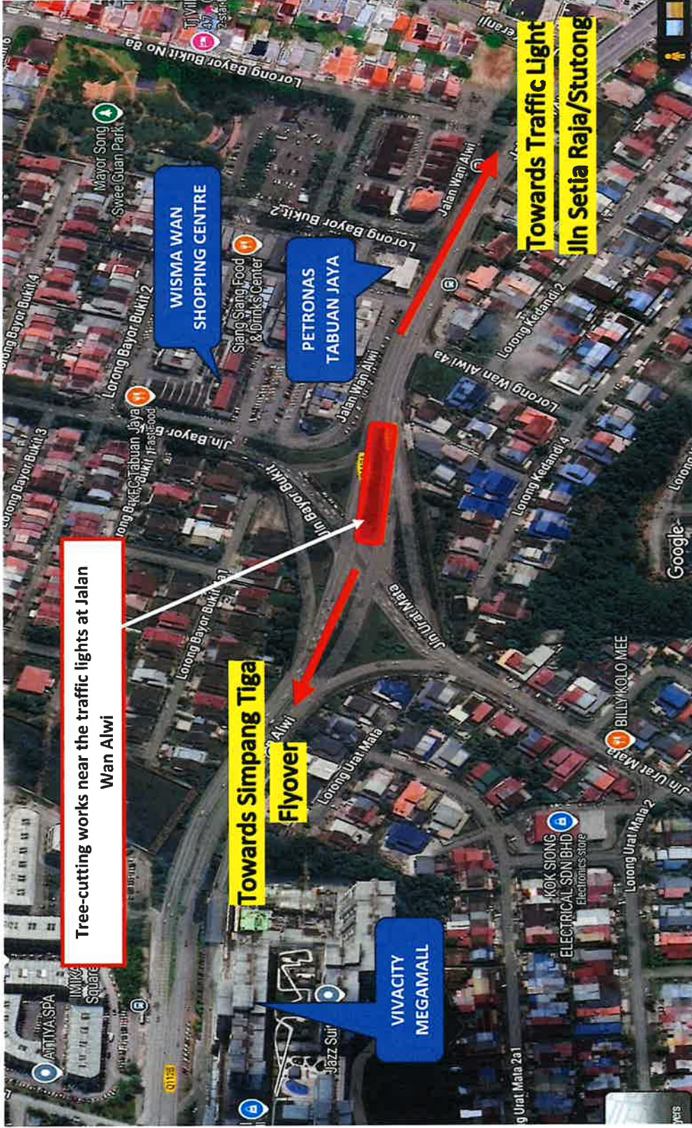
Attachment 1: Location plan of work area at the traffic light at Jalan Wan Alwi, Kuching Lampiran 1: Pelan lokasi kawasan kerja berdekatan lampu isyarat di Jalan Wan Alwi, Kuching